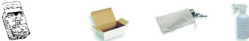
FIGURE 1 INNER CONTAINERS ARE NOT SUITABLE FOR SHIPMENT AS TRANSPORT PACKAGES